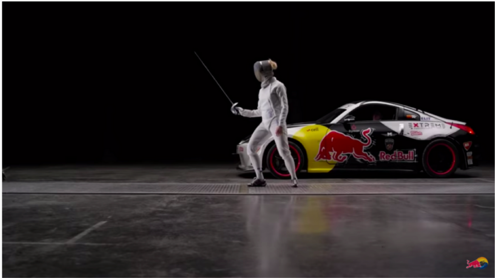
#RedBull350z The Physics and Speed of Fencing 370,920 views